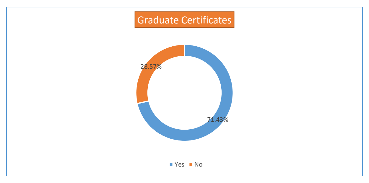
Figure 1. Graduate certificates.

2. Did you receive a graduate certificate(s) from the College of Charleston?